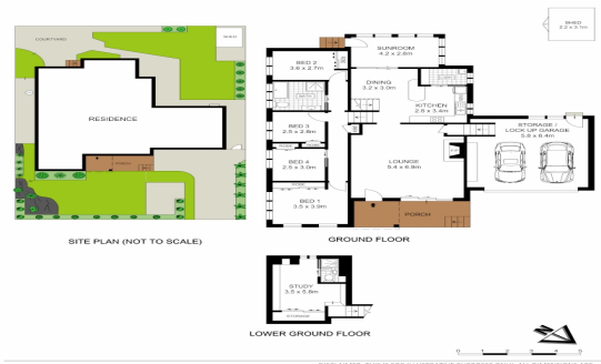
28 Rosewall Drive, Mena